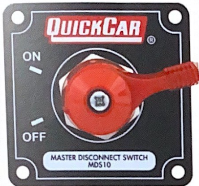
A typical master disconnect switch

Watson Diesel has always been a proponent of the installation of a battery master disconnect switch. This simple device has been around for a long time, and most larger trucks and equipment come from the factory with these switches as standard equipment. When located close to the battery box this switch isolates the batteries from all other components and wiring running from the battery. If a truck does not already have a master disconnect, one can be added to an existing system. These trucks have hundreds of feet of wiring and many relays, switches and junctions that can easily rub through or short out even without the engine running.